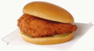
Chick-fil-A® Chicken Sandwich $3.75