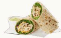
Chick-fil-A® Cool Wrap $6.29