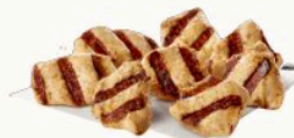
Grilled Nuggets $4.59