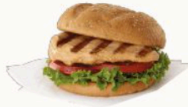
Grilled Chicken Sandwich $5.15