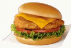
Chick-fil-A® Deluxe Sandwich $4.45