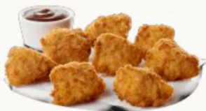
Chick-fil-A® Nuggets $3.85