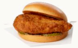
Spicy Chicken Sandwich $3.99