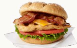
Chick-fil-A® Grilled Chicken Club Sandwich $6.55