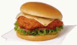
Spicy Deluxe Sandwich $4.69